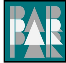
PAR Hours, Workshops