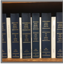
How the HRS is Affected