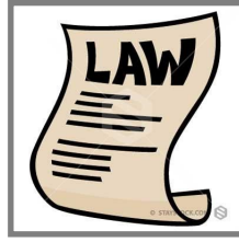
Finding the Acts of Law