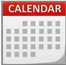
The Session Calendar