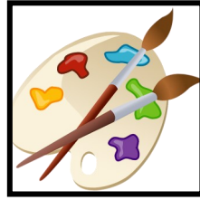
Art at the Capitol