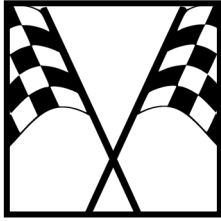
What Just Happened