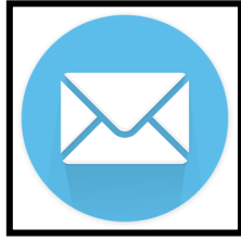
Lobbying the Governor