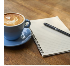
Coffee Hour with PAR