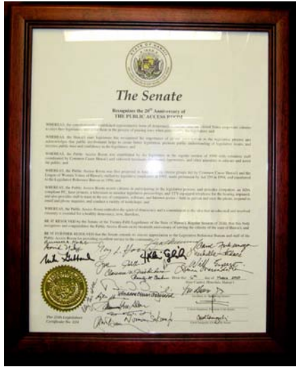
"The Senate Recognizes the 20 th Anniversary of The Public Access Room"