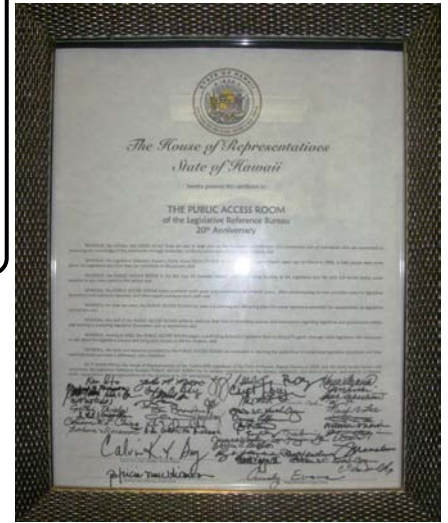
"The House of Representatives State of Hawaii hereby presents this certificate to the Public Access Room of the Legislative Reference Bureau 20 th Anniversary"

BE IT FURTHER RESOLVED that the Public Access Room looks forward to assisting citizens as they participate in their governance.