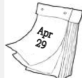
The days are flying by!